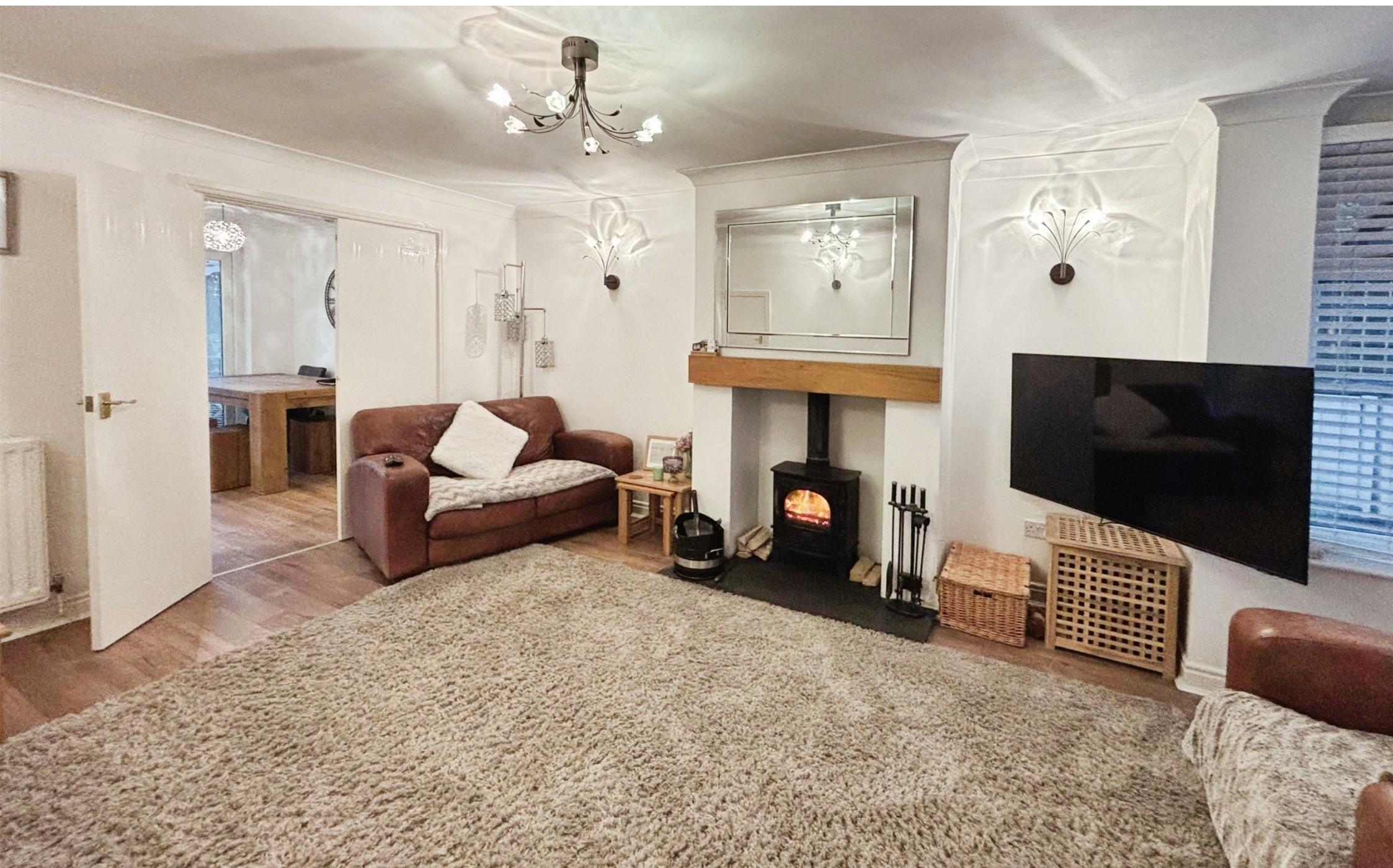
Cherry Tree Drive | Sunnybrow, Crook £295,000